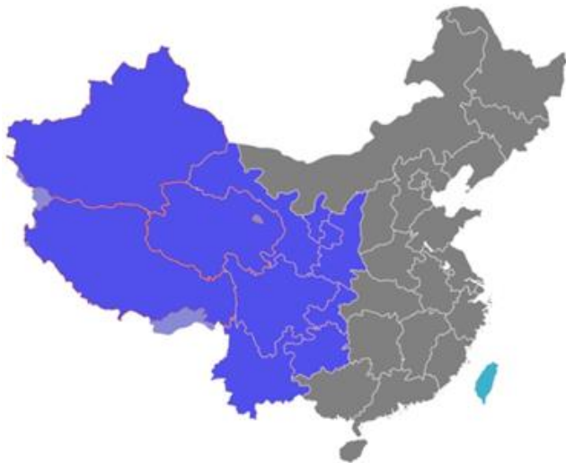
Fig. 2. Western Regions