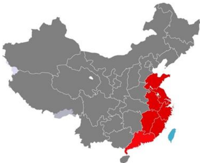
Fig. 3. East coastal regions