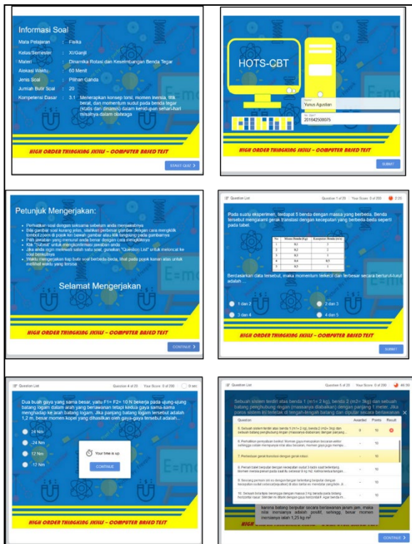
Figure 2. Instrument display after revision