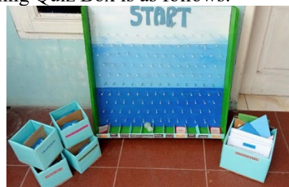
Rolling Quiz Box Media

From the results of observations made by researchers at MIN 12, Medan City, specifically in class 3, the Rolling Quiz Box media has never been