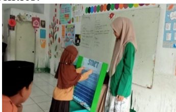
Figure 2. Using Rolling Quiz Box Media

conducted during 2 meetings in each class, namely the control class and the experimental class. The test was given twice to students to obtain data on research needs. The learning process begins with giving a pre-test to students, then they are given treatment, then at the end of the learning process, students are given a post-test to determine whether or not there is a significant influence from the use of Rolling Quiz Box media on students' critical thinking abilities.